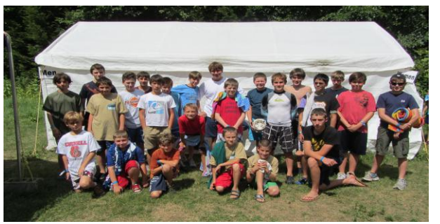
Troop 5 Scouts embark on rafting adventure